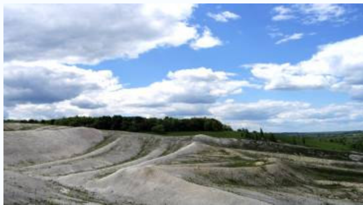
The old chalkpit

The name Belgorod (like Belgrade in Serbia) is the Slavic for "white city". It's because the city of Belgorod is situated on the large deposits of chalk.