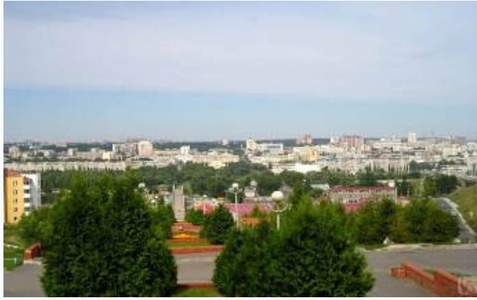
The city Belgorod today

Belgorod is an administrative, industrial and cultural centre of Belgorod region, established in 1954. The main educational centres are the Belgorod State University, the Belgorod Shukhov State Technological University, the Belgorod Agricultural Academy and Financial Academy. There are five museums, two theatres, four cinemas, six cultural centres, twenty libraries in Belgorod. The Belgorod Academic Theatre is named in honour of the famous 19th-century actor Mikhail Shchepkin who was born in the vicinity.