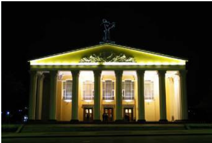
The Belgorod Academic theatre

Belgorod is an administrative, industrial and cultural centre of Belgorod region, established in 1954. The main educational centres are the Belgorod State University, the Belgorod Shukhov State Technological University, the Belgorod Agricultural Academy and Financial Academy. There are five museums, two theatres, four cinemas, six cultural centres, twenty libraries in Belgorod. The Belgorod Academic Theatre is named in honour of the famous 19th-century actor Mikhail Shchepkin who was born in the vicinity.