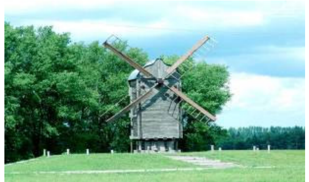
The views of Belgorod

More detailed information about Belgorod and Belgorod region You can find on